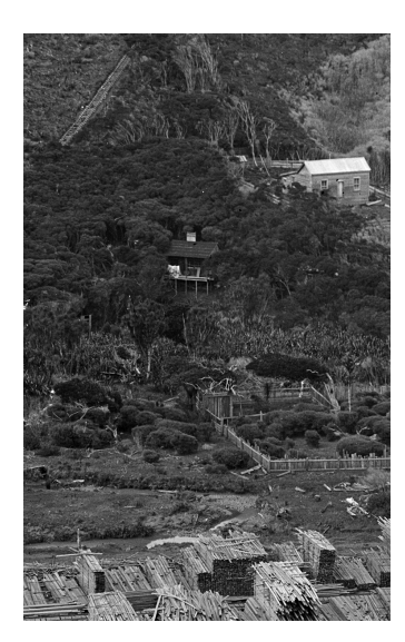
Figure 2: Detail of A. P. Godber's panorama of Piha (Fig 3) showing Knutzen's hut and his outhouse latrine (lower left), ca. 1915-16. The rail track visible in the upper left was used to transport timber between Piha and Karekare. The mill pig pen is visible in the foreground. Dry plate glass negative, APG-0671-1/2-G. Part of A. P. Godber Collection, Alexander Turnbull Library, Wellington, New Zealand.

well-built buildings that related to community life.<sup>40</sup> This interpretation of New Zealand's original architecture established a precedent that was rhetorically applied to the architecture of Garrett's "New Pioneers" of the 1950s.