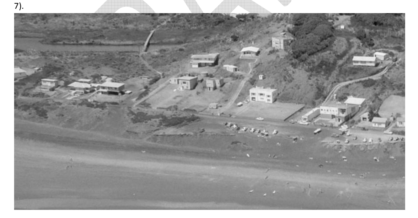
Figure 7: Photograph from 1963 showing area of Piha fronting surf club and areas to the north. Note that dunes fronting the surf club have now been levelled to create a car park and the dune face seaward of this car park is now largely devoid of vegetation. (Whites Aviation photo – from Alexander Turnbull Library).

In the mid 1950's, levelling of dunes in front of the surf club began to create car parking and this area was progressively extended into the 1960's (Figure