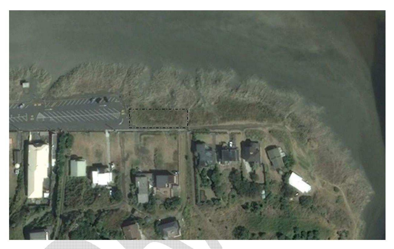
Figure 13: dashed line outlines backdune area to the immediate north of the surf club car park within which a grassed viewing area could potentially be established – subject to appropriate design and consultation.

adjacent to the surf club car park but also borders the beach access from the Domain. However, any future development of elevated grassed viewing area in this location would require appropriate design and consultation. Additional beach accessways might also be required.