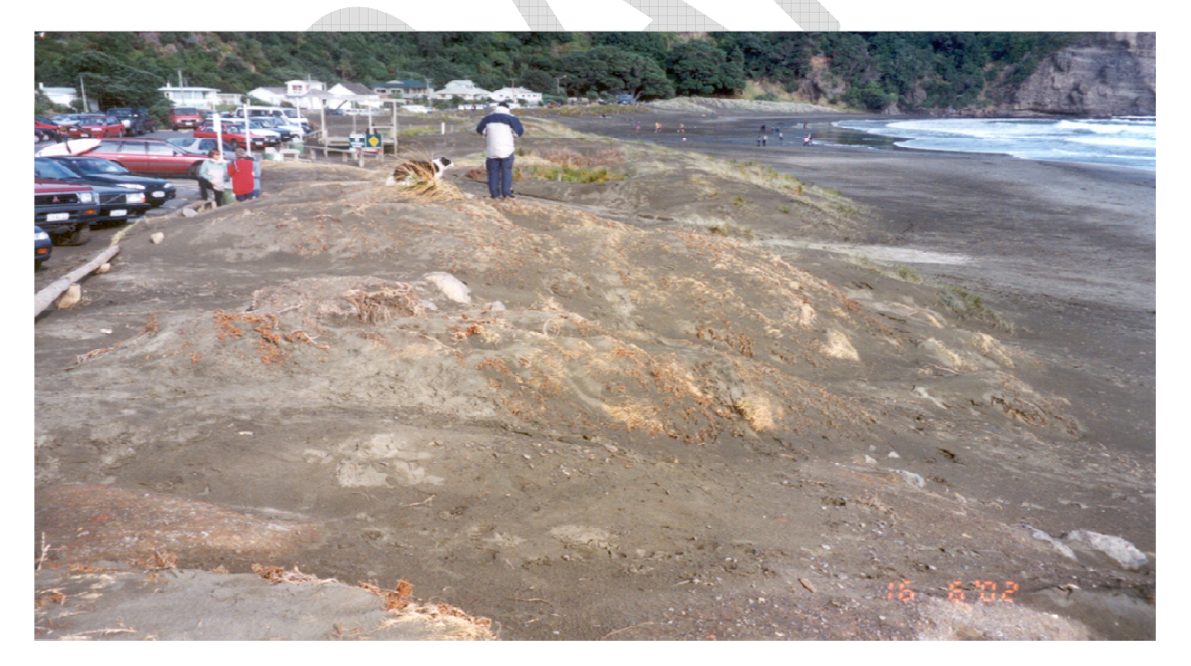
Figure 10: Area in front of surf club (undated but circa 2003) - before commencement of Coastcare dune restoration works.

By the early 2000's, the high use area in front of the surf club was still seriously damaged with exposed clay fill and very little native sand trapping vegetation (Figure 10).