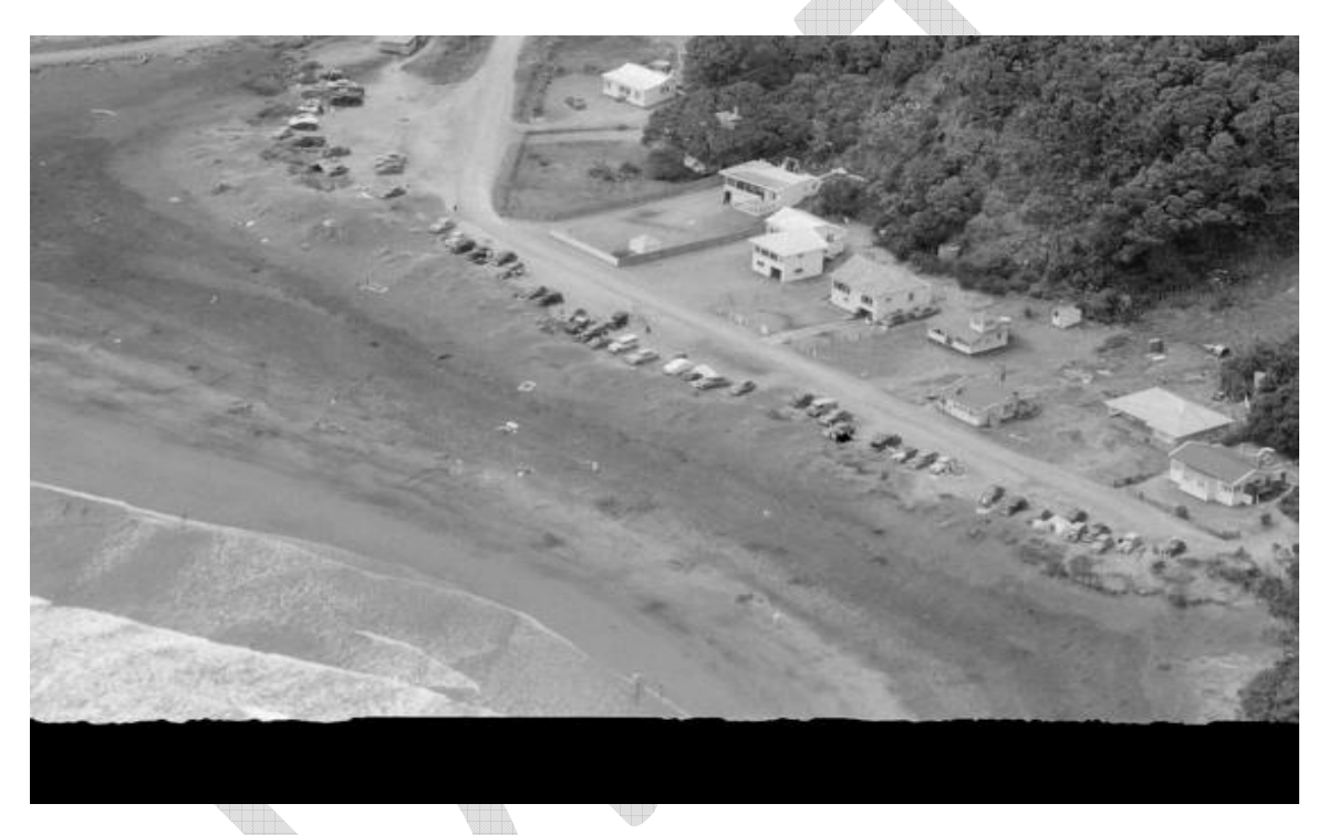
Figure 8: Photograph of southern car park area dating from January 1963.

Parking occurred along the full length during high use periods and access to and from the beach was unmanaged – resulting in extensive disturbance of sand trapping vegetation on the seaward dune face by the early 1960's (Figure 8).