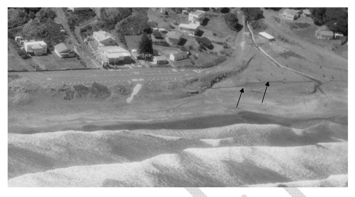
Figure 9: View of surf club car park and Moana Stream entrance area in 1985. Note the concrete stream training works in the Moana Stream and the placement of sand trapping fences (arrowed) to create dunes on the immediate northern side of the former embayment.

By the early 2000's, the high use area in front of the surf club was still seriously damaged with exposed clay fill and very little native sand trapping vegetation (Figure 10).