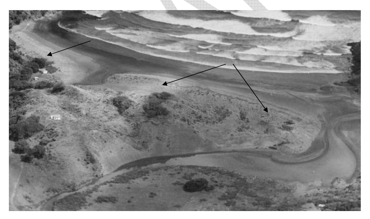
Figure 4: Photograph of Piha Beach dating from the early 1930's showing areas of natural dunes (arrowed) – also evident in earlier photos.

The photos indicate a relatively extensive cover of spinifex over the dune areas and patches of darker vegetation further landward, with little to no evidence of human damage (Figure 4).