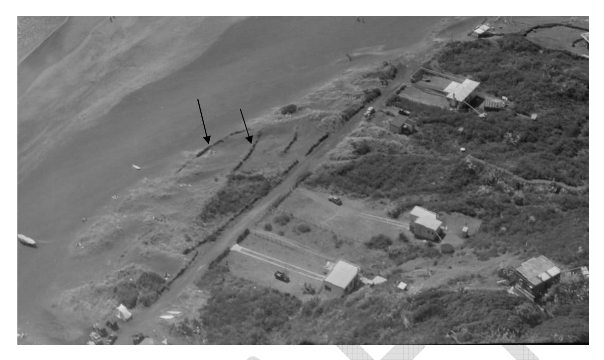
Figure 6: Photograph of Piha taken in January 1951 to the immediate north of the surf club showing brush fences (examples arrowed) erected to control wind erosion.

In the mid 1950's, levelling of dunes in front of the surf club began to create car parking and this area was progressively extended into the 1960's (Figure