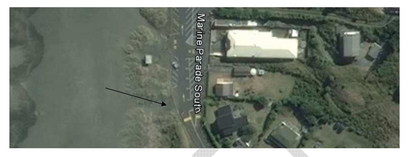
Figure 11: Location of informal accessway (arrowed) at the southern end of the surf club car park. It is recommended that this accessway be formalised and defined.

iv. An additional defined accessway be established at the southern end of the surf club car park (as arrowed below in Figure 11) where an informal accessway presently exists.