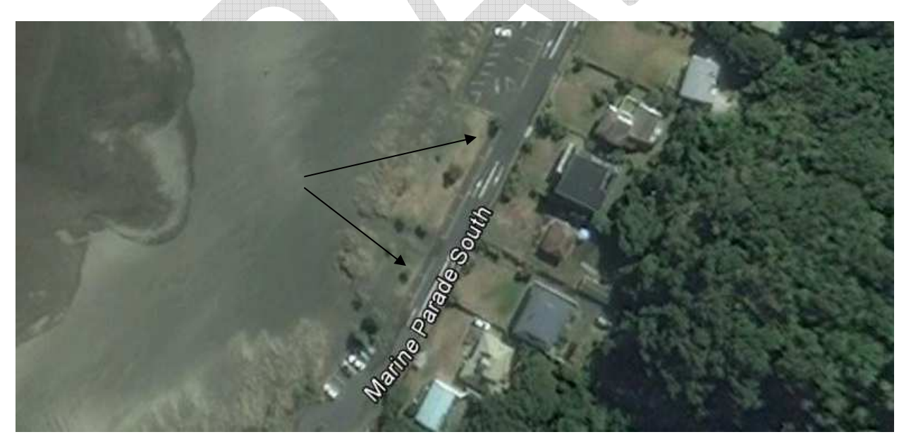
Figure 12: Grassed area behind spinifex zone at western end of the southern car park. This area provides an important grassed elevated viewing area and could readily be levelled to improve suitability for use.

In terms of more immediate action, the existing grassed area at the western end of the southern car park (arrowed in Figure 12) is already extensively used and could be enhanced for use in the near future. For instance, ground levels are presently irregular and the area could be leveled to improve it for recreational use. There are also existing small pohutukawa here that will in time provide useful shade – though they may need to be managed (e.g. periodically opened up with careful pruning) to maintain views from landward.