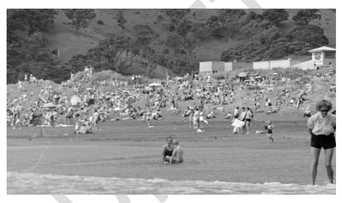
Figure 5: Photograph of area in front of the former surf club. Note people sitting all over the seaward face of the frontal dune, damaging the sensitive native sand trapping vegetation.

For instance, in the vicinity of the surf club, early subdivision extended seaward over the natural dunelands reducing the width of natural dunes further seaward. Photographs from the 1940's show poorly managed human use, with intense human pressure on the critical sand trapping vegetation on the seaward dune face (Figure 5)