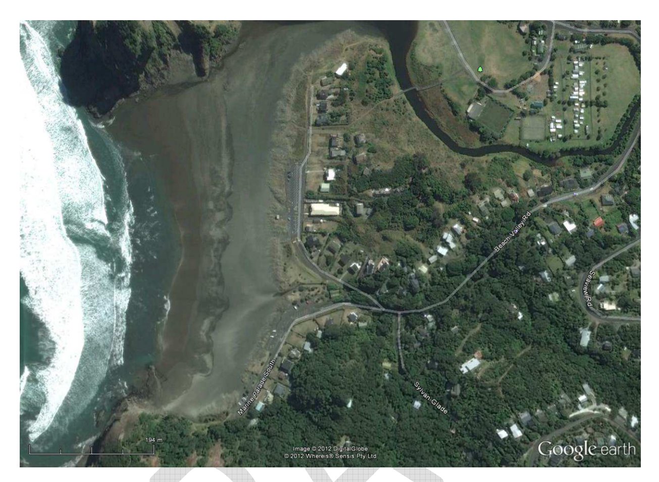
Figure 1: Area of Piha Beach relevant to this review