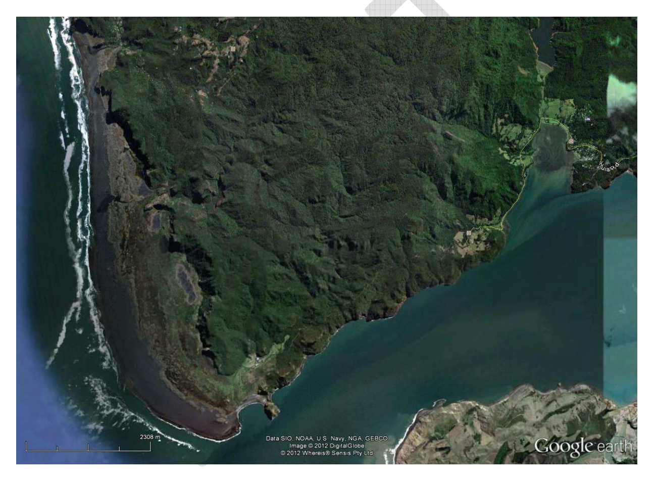
Figure 2: Sand accumulation at Whatipu

The very large volumes of sand which have accumulated at Whatipu over this period are evident in aerial photographs of this area (Figure 2). Prior to this accumulation the shoreline lay along the rocky cliffs behind.