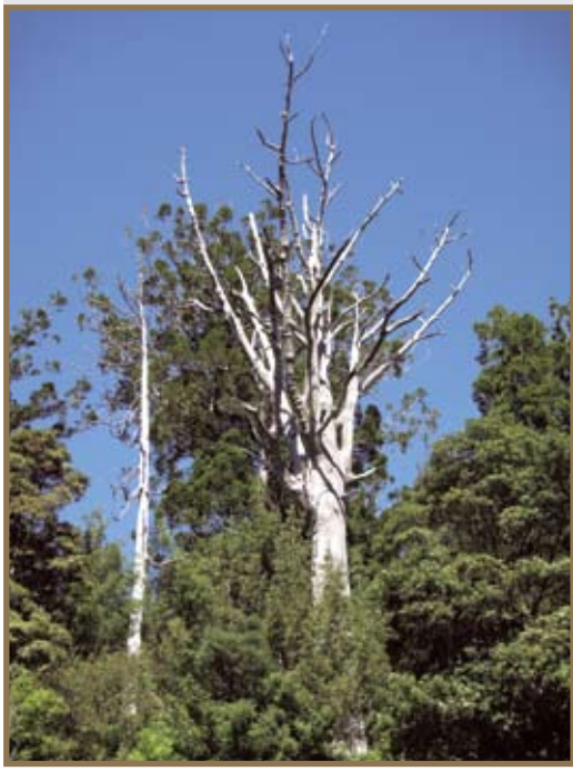
Above: Dead branches and a thinning canopy resulting in stag-heads

PTA is a fungus-like disease that is spread in soil and water via two different forms of spores. The soilborne spores have a hard outer shell that allows survival in soil and transportation within soil on equipment (for example footwear, earth moving machinery), while the water-borne spores have a small tail which allows movement through water (catchments or water films in soil) to other areas of kauri.