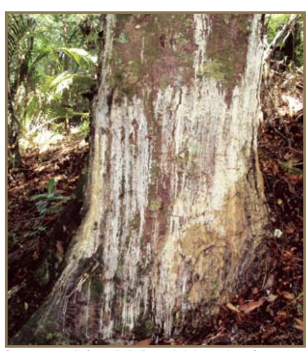
Gum can eventually form a "collar" around whole lower base of tree

The collaborative effort to address kauri dieback includes MAF Biosecurity New Zealand, the Department of Conservation, Auckland Regional Council, Northland Regional Council, Environment Waikato, Environment Bay of Plenty and Maori