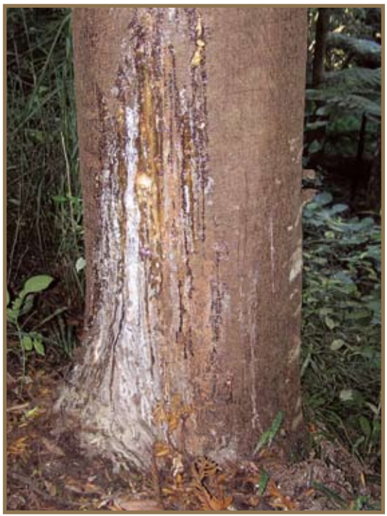
Gummosis: fresh bleeding gum around base of tree

Other factors that can cause a decline in the health of kauri include living "on the edge" (unprotected by other trees), lack of water or "wet feet", strong winds, soil compaction, disease and root disturbance. If no gum can be seen on the lower trunk of a sickly kauri, it may be suffering from one of these stressors.