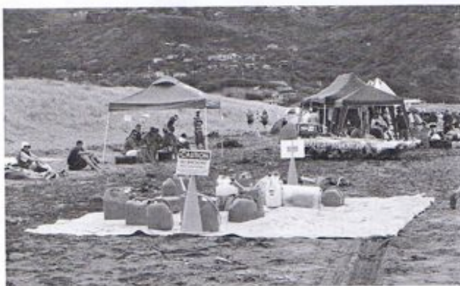
Containers of fuel on the beach ready for burn-off